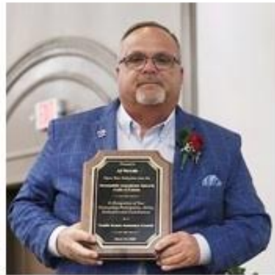
Al Woods Youth Coach Baseball